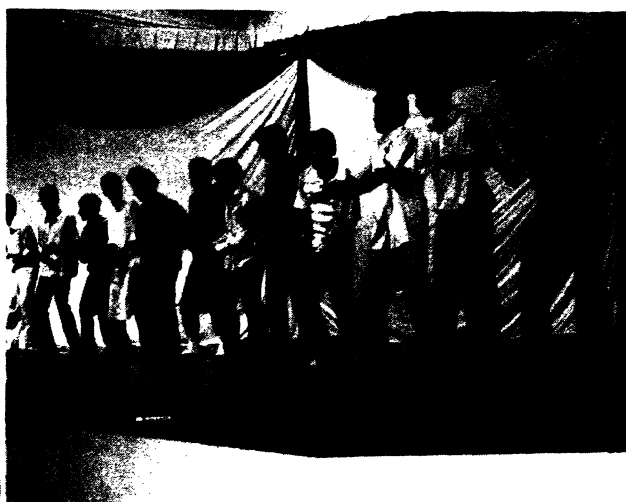
The twelfthies dancing to the tunes of Jhoom Barabar Jhoom.