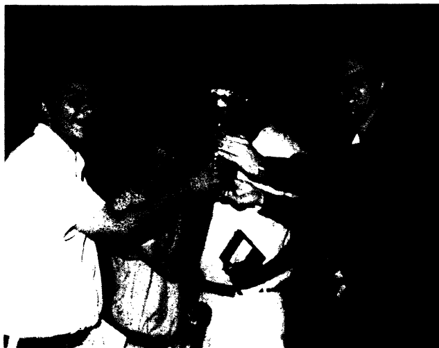
The debating team from Vasant Valley School receiving the trophy

teams being The Mayo College Girls' School, The Vasant Valley School, St. George's College, Sherwood College and La Martiniere Girls' College and the local teams were Rashtriya Indian Military College, The Doon School, Welham Girls' School and the hosts Welham Boys School.