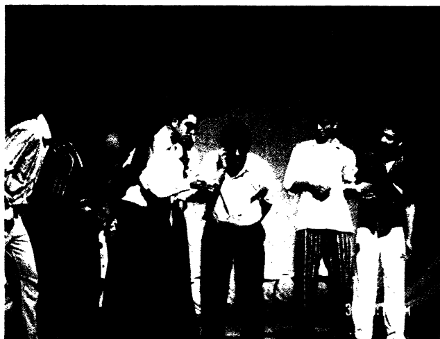
A scene from the eleventhies' play, 'Big Trouble in Little Welham'