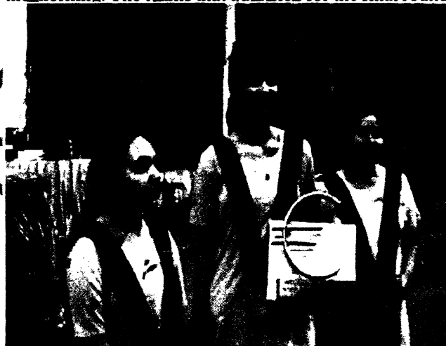
The jubilant Mayo Girls' College quiz team with the trophy

On 8 th September, the 3 rd Inter School Financial Studies Quiz was held. Out of the eight schools that participated, Riverdale High School and Mayo College were eliminated in a preliminary written round held in the morning. The teams that qualified for the final round