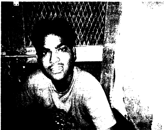
The 'dude' in the phonebooth

The saviour of many a broken heart, this man has been one of the few in Welham to understand our heart rendering love stories. He's here without fail everyday at 4 p.m. to manage his little but seriously comfortable dugout, in the Hughes Block, known by the name 'Surendra Communications' (though I acutely believe that most of us may not know it for sheer lack of interest in anything else except the person on the other side of the line.)