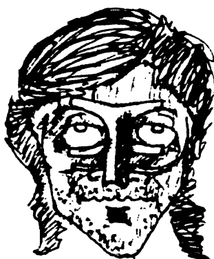
The ED Robo-copped!