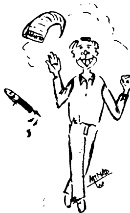
FREE FROM THE APPENDAGE