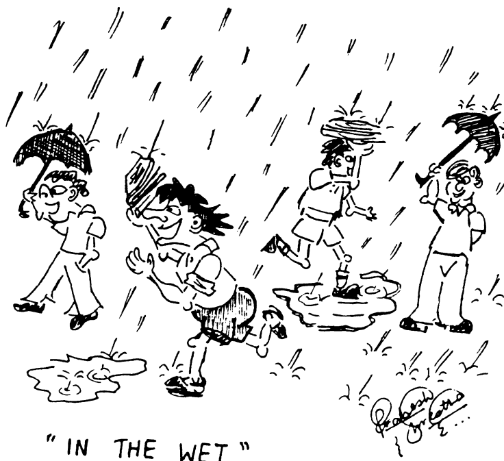
" IN THE WET "