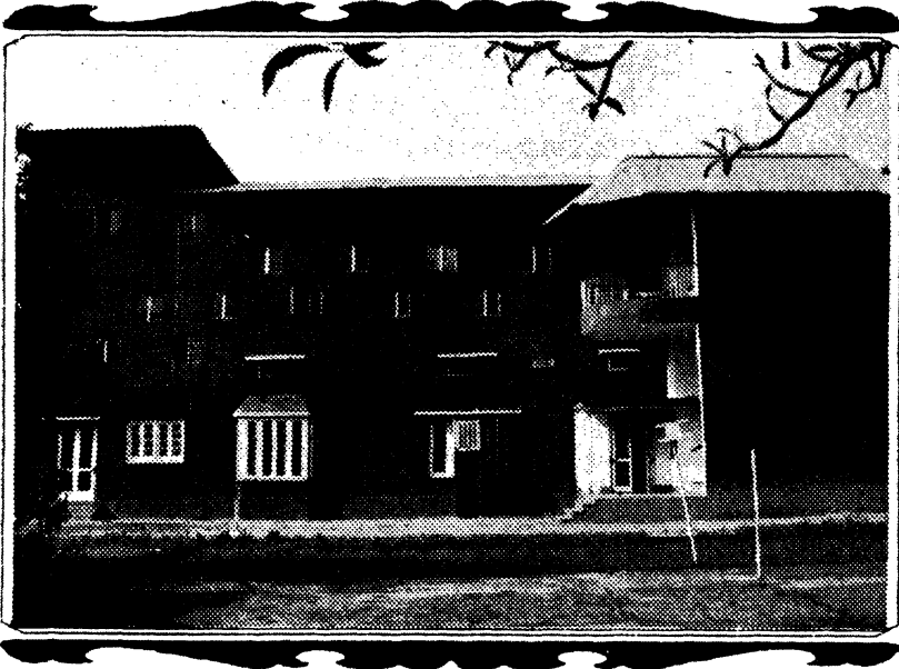
P. H. (PRAYAG HOUSE) HIS BRAINCHILD