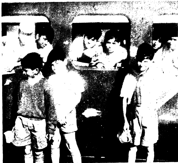
All set for mid-term.